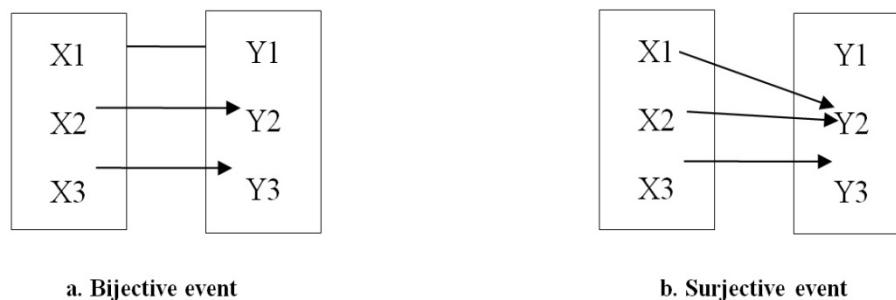
Figure 1. Stative Locative Events

This conceptualization is illustrated in Figure 1.