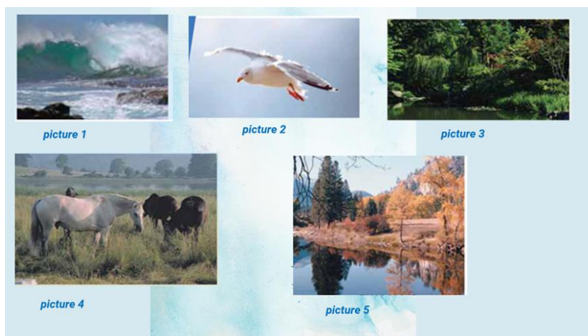
Figure 1. Pictures From the Physics Textbooks (5th and 6th Grade, Ages 10 and 11) Used in Primary Schools in Greece 6

More specifically, in the first activity, each teacher-student group had to choose four out of the five pictures that were given to them (Figure 1).