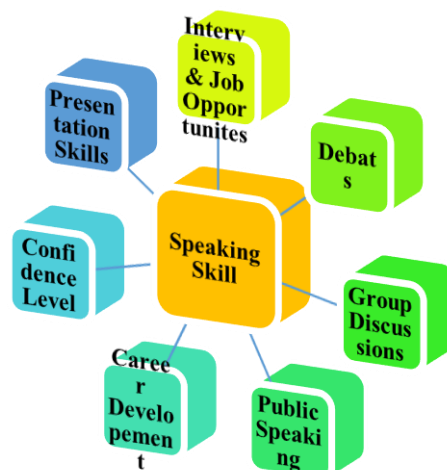
Figure 2: Speaking Skill and Its Importance

world and concentrate completely on the speech. Clarity of speech is crucial for good interpersonal communication. Listening and reading are examples of passive or receptive talents, as students cannot demonstrate their ability in these tasks. They merely listen to or read the language, but do not generate their own ideas. In order to independently construct sentences, students will require a considerable deal of experience and knowledge of grammar, vocabulary, sentence structure, and use. Thus, speaking and writing are considered productive or active skills.