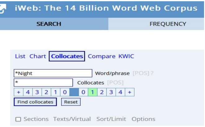
Figure 2 Starting the Process of Finding Collocations

In weeks 3& 4 , Corpus stylistic tools are presented to the students through the virtual class such as online corpora and corpus tools. They are informed how to use BYE- BNC and the learners are guided toward independent learning tasks. These include searching for collocations, word relations, and collocation networks. They are directed toward the use of online corpora to examine concordance lines about a particular node. For example, the participants are asked to find the collocates of the node 'Night' from the poem 'Goodbat Nightman'.