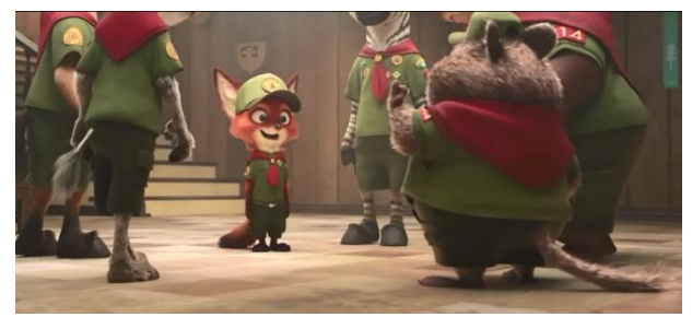
Figure 4. Zootopia: time step 00:58:48 (Howard & Moore, 2016)

prays even the woodchuck who is much smaller than foxes in the real world. The second is the function of detabuization as authors imply the problem of discrimination and do not interfere ecology of communication with the viewer. They encourage the viewer to come to a conclusion that is incongruous to Nick's that under such circumstances " there's <u>no</u> point in trying to be <u>anything</u> else ", where he uses the negative words (underlined). The verbal mode supports it as the main character, using positive lexis, implies " Judy Hopps: Nick, you are so much more than that " (Zootopia: time step: 01:00:03 – 01:00:08; Howard & Moore, 2016). So, the authors in this scene teach the viewer not to be prejudiced and follow your dreams even if it seems the whole world is against you.