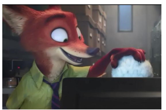
Figure 3. Zootopia: time step 01:01:23 (Howard & Moore, 2016)

This example demonstrates that the predator treats the prey like an object. He touches her wool and notes that it is "So fluffy" — something soft which describes characteristics of an object, not a person. Though the word "fluffy" has a slang meaning – "usually describing a person or behaviour that is soft, cute and anything unmanly normally seen as an insult or an embarrassment" [Peckham], and this meaning is also offensive. The fox pays attention only to her wool and uses the description "cotton candy" which denotes a type of food. These meanings are supported visually as the fox looks very excited touching her wool (Fig. 3). Collaborating the modes create the comic effect and perform the exposing function, the Fox's behaviour turns out to be very offensive thus he means well.